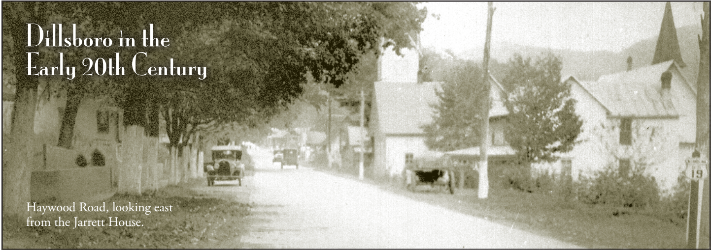
Haywood Road, looking east from the Jarrett House.